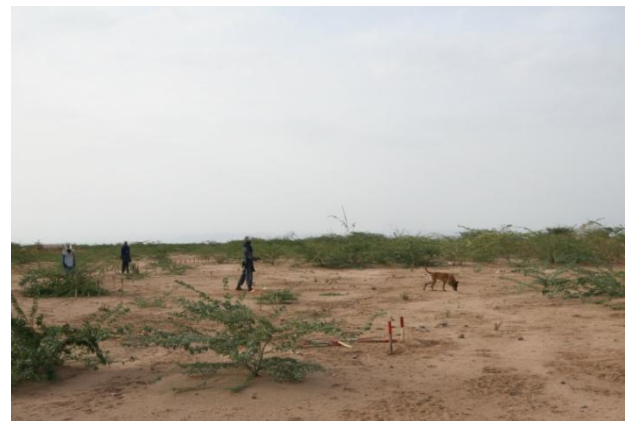
MDD and dog handler operating in Shenelle. On this task MDD are used as the first asset.