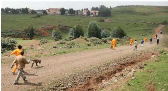
Each student was issued a dog. Here during the first day long walk outside the centre.

Between 31 May – 8 June the first external course was conducted at Entoto Training Centre by Ethiopian Mine Action Office (EMAO) with assistance from NPA MA Ethiopia. 9 representatives from South Sudan Demining Authority (SSDA), United Nation Mine Action Office in Sudan (UNMAO) and NPA MA Sudan participated in a Mine Detection Dog Introduction Course. The training is a part of a partnership agreement NPA has facilitated to be signed between EMAO and SSDA, on behalf of the two governments. In the agreement the two authorities agrees in principle to assist each other, both in the capacity building and in specific mine action projects in the border region.