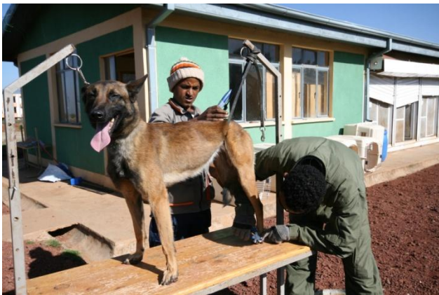
Friday maintenance of Zafar – one of 10 dogs that since September 2009 have been trained in Entoto.