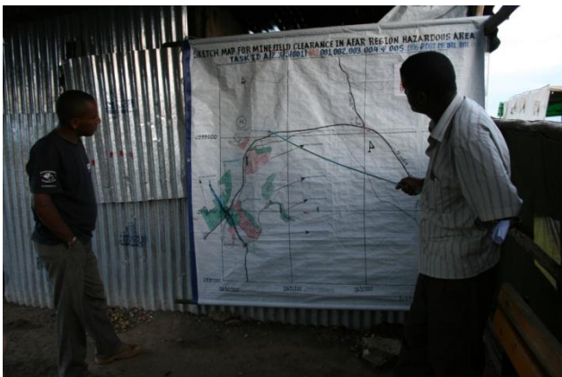
Site brief by the company commander in Coy 3 in Awash.

As previous reporting periods, EMAO has focused their operational clearance assets in Tigray (2 manual companies), Afar (2 platoons from company 3), Somali (1 manual company in Bare, one platoon from Coy 3 in Shenelle). By the end of this reporting period one manual company deployed to Dire Dawa , to clear a minefield just outside the town. In the reporting period no machines have been operational.