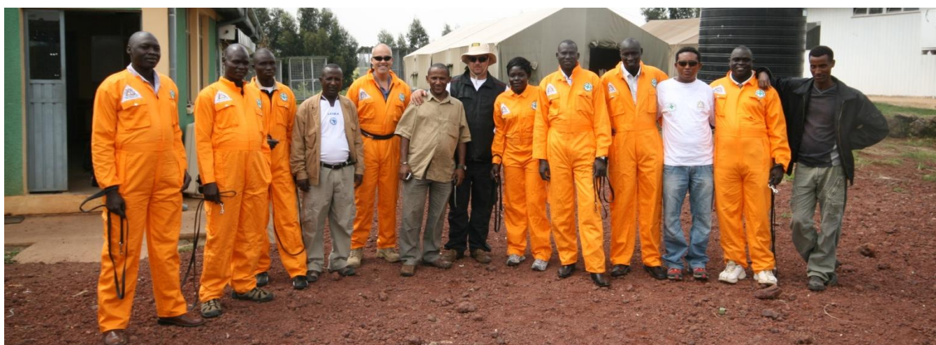
Representatives from South Sudan (orange overalls) together with the EMAO and NPA MA Ethiopia staff during the MDD Introduction Course.