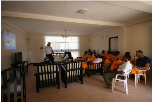
Instructor house already in use and equipped with furniture. Here in use during the MDD introduction course in June.