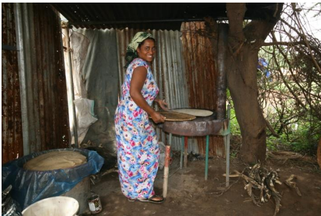
Female EMAO staff in Shenelle field camp. These women work on short term contract, in an agreement between the local community and EMAO.

EMAO field based teams are living in the communities they are clearing. In each site there is a site manager in charge of all activity. Normally this is the company commander, and he is also the senior link to the local community. Before deploying to a new area the site manager visit the community and agrees in detail what regulations the team is to follow, in addition to the guidelines in the EMAO SOP. During these meetings the site manager agrees with the community on how the field camp is to be established and run without destroying the local environment.