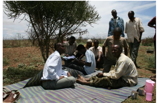
The TS /RR team doing the Phase 1 of the Task Impact Assessment in one community in Somali region.

The Technical Survey teams / Rapid Response teams have been deployed in the same regions as the clearance assets, but one team deployed shortly to Gambela to assist the road construction company building the road from Gambela to Sudan with clearance of nuisance mines inside the corridor the construction is going to take place.