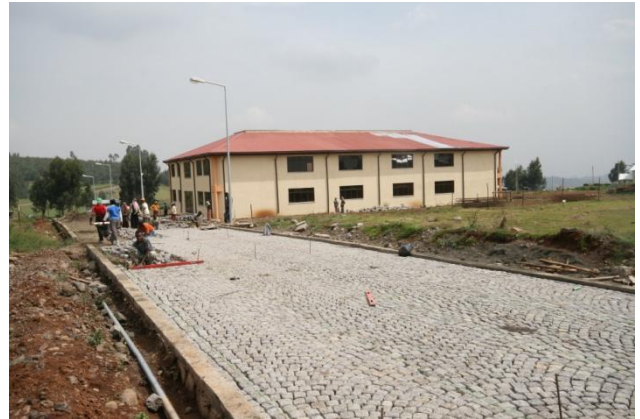
Cobble stone is being fixed on the inner road.

The construction of the training centre is going according to schedule.