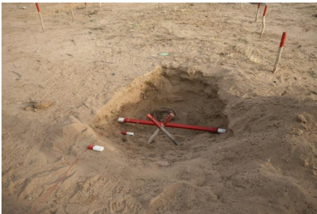
M-15 AT mine found by MDD in Shenelle – 70 cm deep.

The MDD teams have been deployed with the manual capacity in Somali region. 10 MDD teams 21 dogs) in Shenelle and 4 MDD teams 8 dogs) in Bare. Due to the road condition in Bare the MDD asset was pulled out in beginning of June, and redeployed with the manual capacity working in Awash – Afar region.